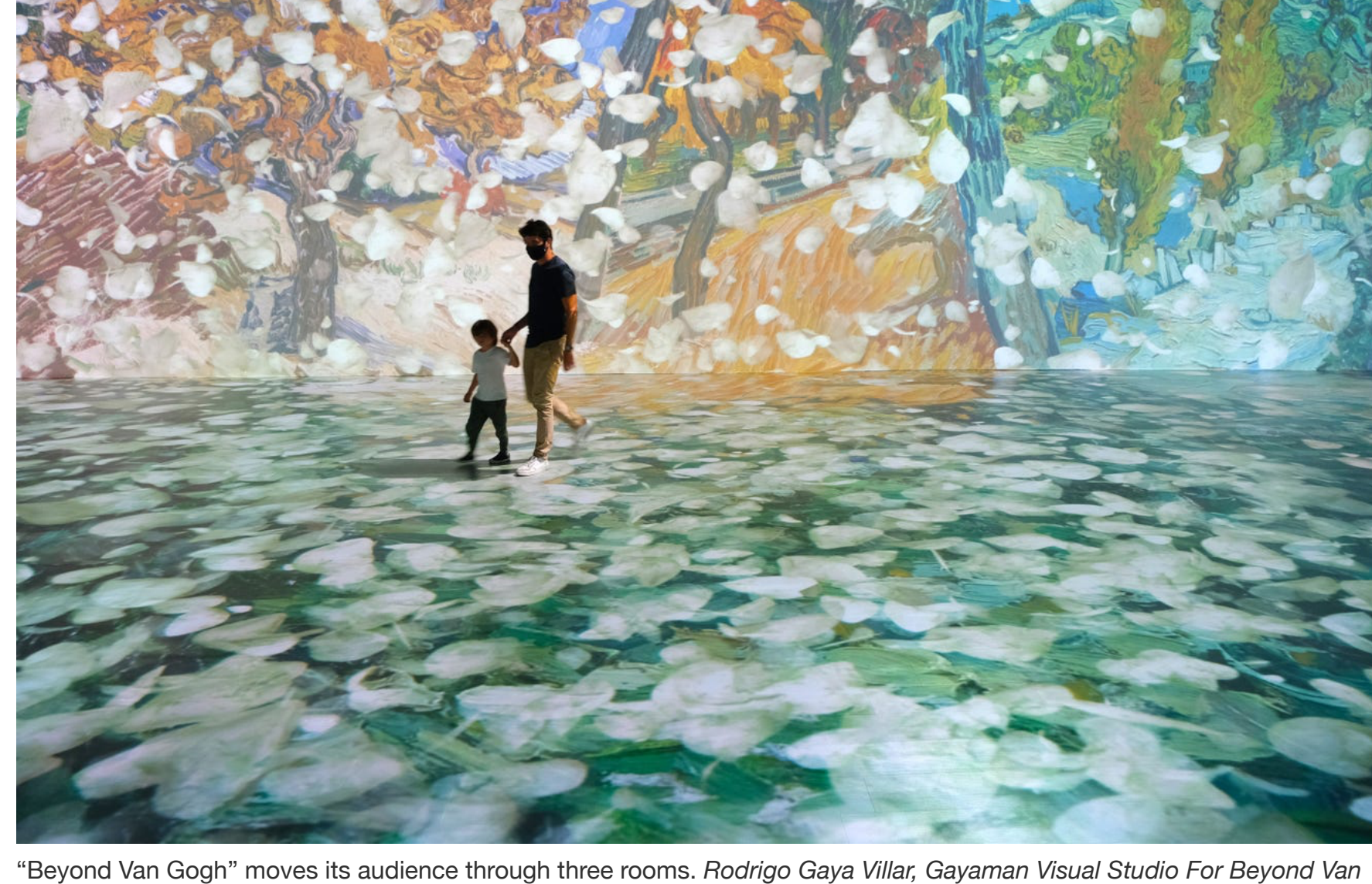
"Beyond Van Gogh" moves its audience through three rooms.

Editor's Note: The Herald-Tribune will have a review of "Beyond Van Gogh: The Immersive Experience" online at 2 p.m. Saturday, March 5 and in print the following day.