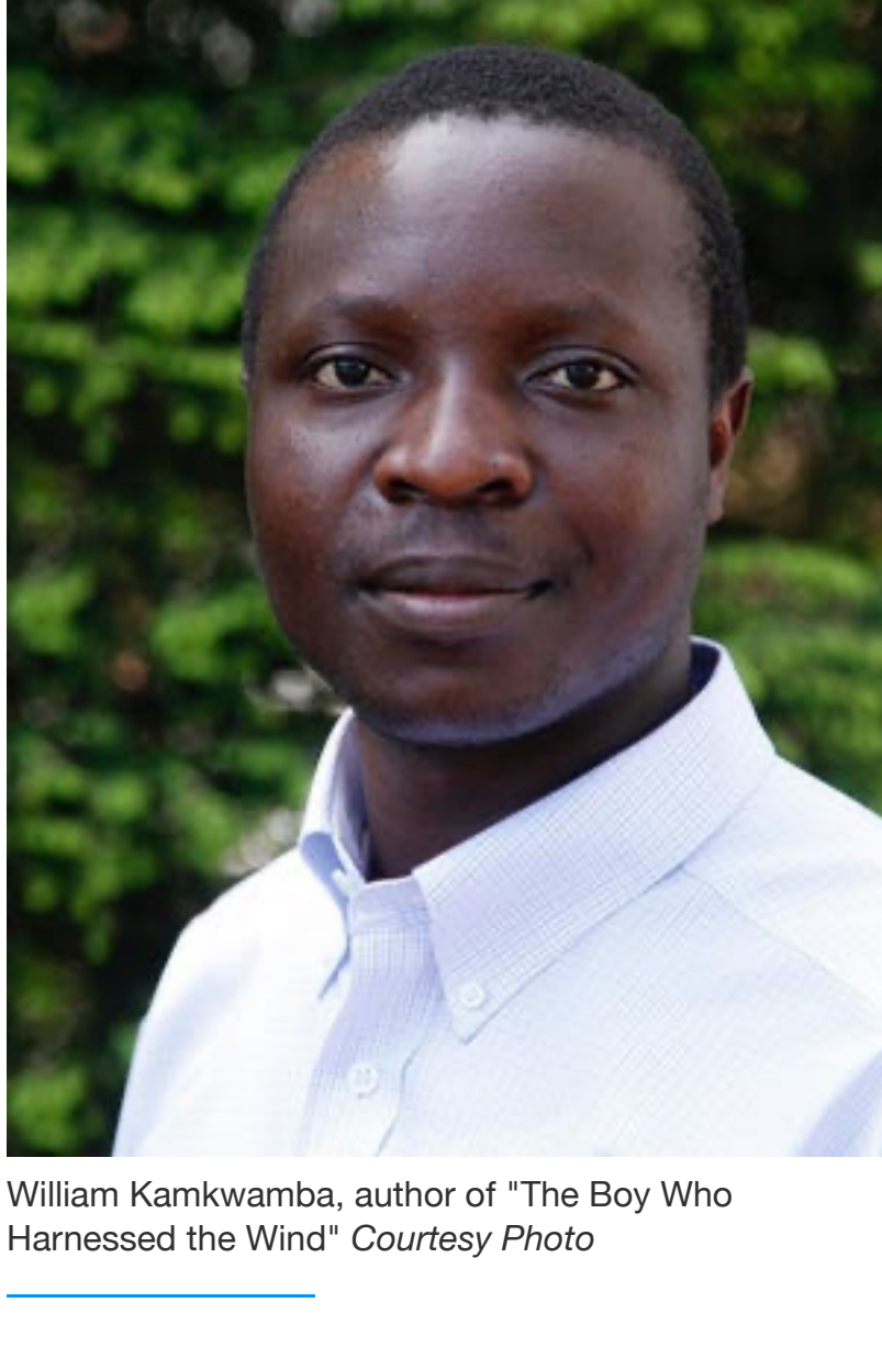
William Kamkwamba, author of “The Boy Who Harnessed the Wind”