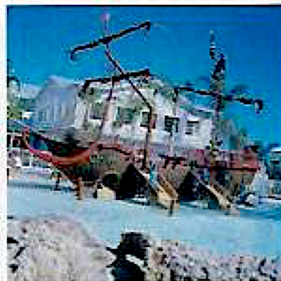
Fun for kids

Aruba offers something for everyone - pristine white sands, adventuresome overland safaris, dynamic water sports plus more than 20 dive sites with over 9 shipwrecks to explore. Most Arubans speak four languages: English, Spanish, Dutch and Papiamentu (the native language of Aruba). And the people make you feel good about being there. In fact, saying it in their native language Aruba makes you feel "bon bini" or welcome. ■