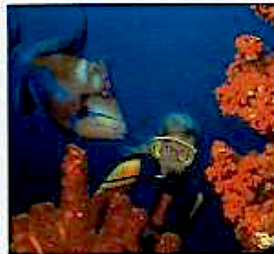
Scuba and snuba observed in Aruba